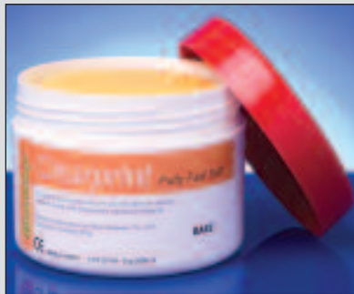
Ortho-Pro-Teknica insists on a two-part putty and light body silicone wash impression

but, my word what a tool! Used by itself or in combination with existing orthodox techniques, ClearStep can deliver astonishing results. You've all heard the expression 'two orthodontists, three opinions'? Though meant as a joke, the above quote serves to illustrate the many opinions and approaches to orthodontic treatment that exist. We at Ortho-Pro-Teknica endeavour to accommodate the diverse and disparate schools of best practice, impartially and without prejudice. In short, we are here for you. You are the clinician, orthodontist or a specialist in your field, we do not seek to dictate your treatment plan or contradict your decisions. Where appropriate we may advise a more efficient route or on occasion warn you of possible pitfalls in your choice of treatment, (based on our experience), but never ever contradict your professional opinion.