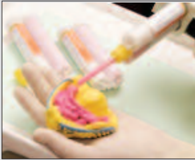
Above: accurate impressions are essential for successful orthodontic treatment